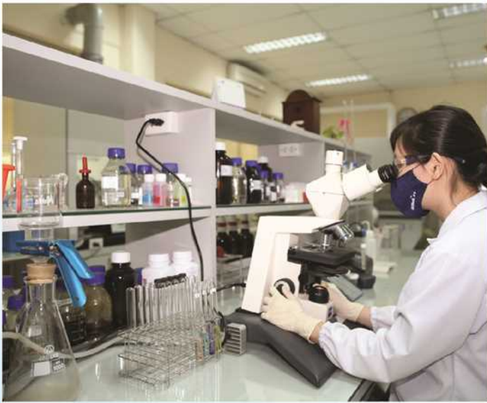
Water and wastewater analysis