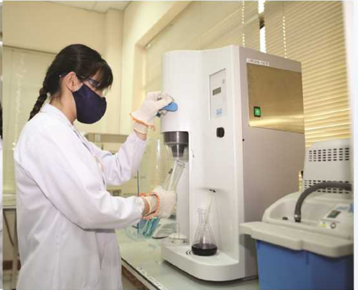
Professional organization, high accuracy